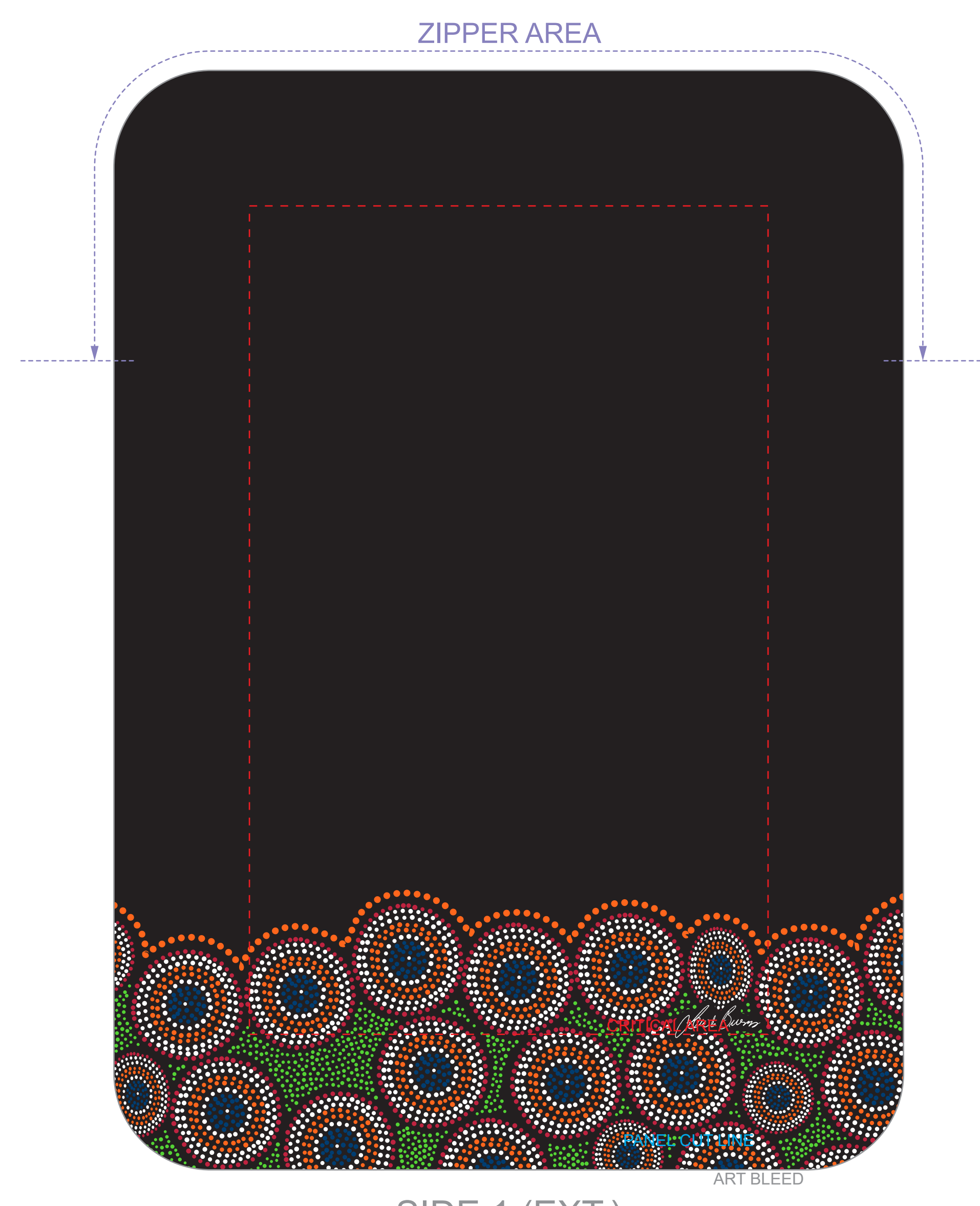
SIDE 1 (EXT.) --- 3mm NEOPRENE ---