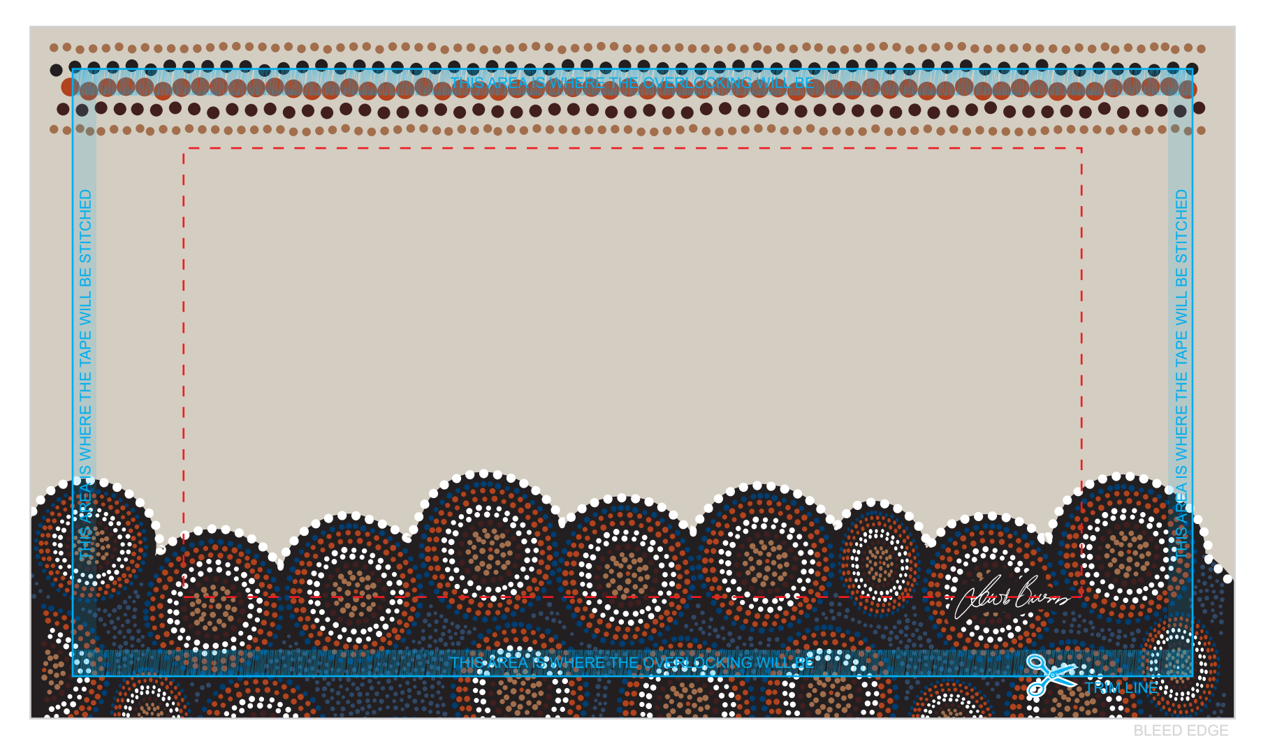
THIS TEMPLATE IS 100% TO SCALE. DO NOT RESIZE!