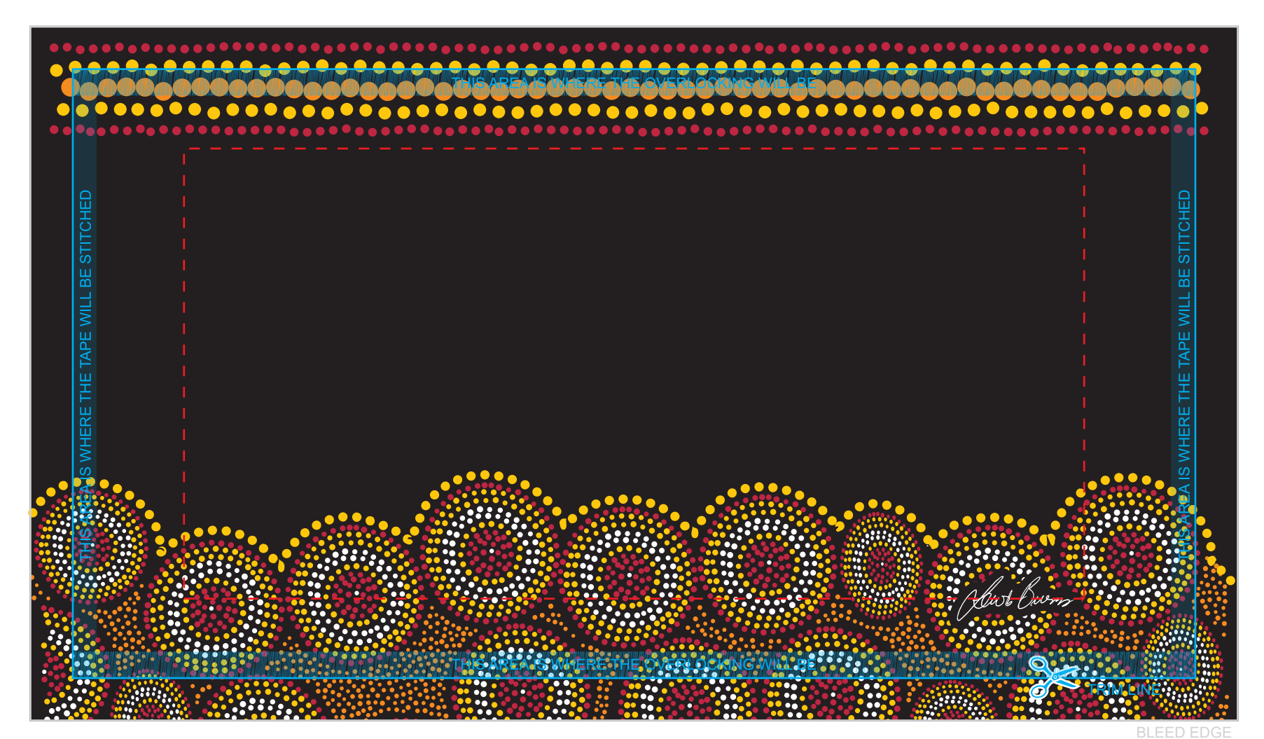
THIS TEMPLATE IS 100% TO SCALE. DO NOT RESIZE!